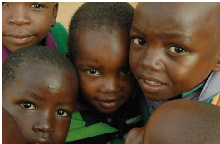
Children can grow up in a world with real hope.

Getting at the underlying causes works better and creates lasting results. It’s time our caring made a lasting difference.