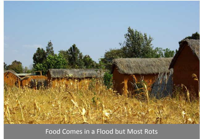
Food Comes in a Flood but Most Rots

Missing Food: Because people are hungry, it is often assumed there is a shortage of food. So poverty reduction and agricultural programs often focus on increasing crop yields. However, the problem of hunger is not so simple. In Tanzania, which is typical of developing nations, 50% of agricultural output rots. Farmers are reluctant to increase yields because they are seeing the waste of much of their work. Meanwhile, in many commodity categories, import levels are around 50% of annual requirements.