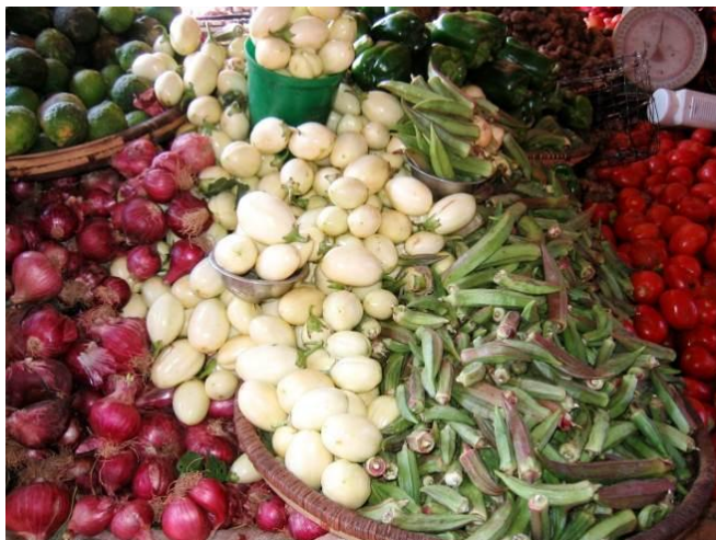
Food Comes in a Flood but Most Rots

Because businesses have no investment capital in $20k to $500k range to get started – and needed leadership mentoring