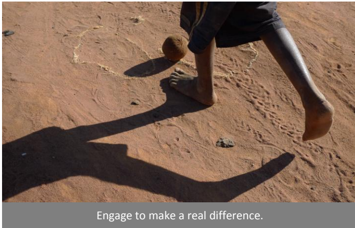
Engage to make a real difference.

The Cheetah Model is not aid in the traditional sense but an investment requiring repayment. The discipline of repayment teaches profitability. Profitability means sustainability, solutions that last. Cheetah invests $5000 to $500,000, filling a gap known as the “Missing Middle.” And the value chain focus helps numerous people with relatively small investments. Cheetah estimates that a one-time $50 investment per person is enough to PERMANENTLY change their income by orders of magnitude.